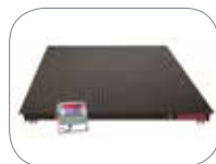
VN Floor Scale